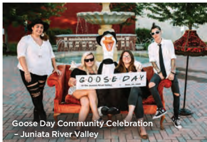
Goose Day Community Celebration - Juniata River Valley

Where heritage and culture meet technology and innovation.