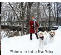
Winter in the Juniata River Valley