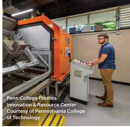
Penn College Plastics Innovation & Resource Center