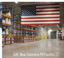
GAF, New Columbia PA Facility