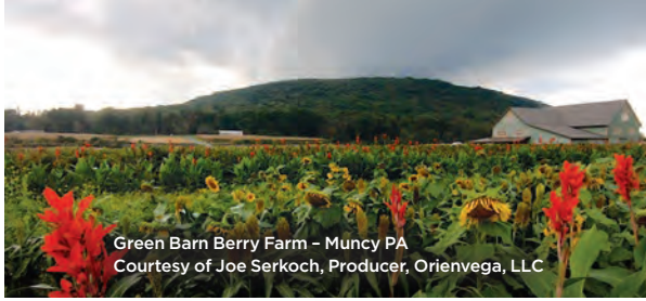
Green Barn Berry Farm – Muncy PA

Where entrepreneurs dream big and make their ideas take flight.