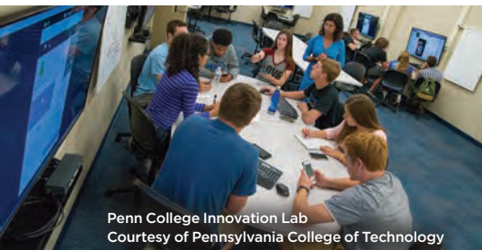
Penn College Innovation Lab

Where heritage and culture meet technology and innovation.