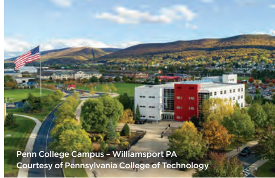
Penn College Campus - Williamsport PA