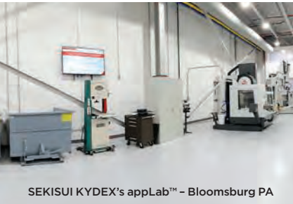
SEKISUI KYDEX's appLab™ - Bloomsburg PA