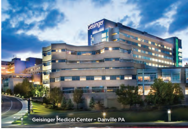
Geisinger Medical Center - Danville PA