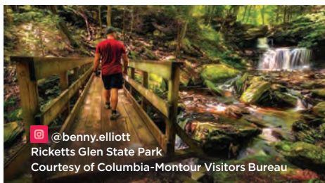
@benny.elliott Ricketts Glen State Park Courtesy of Columbia-Montour Visitors Bureau

Where high-speed internet is as common as horse and buggies.