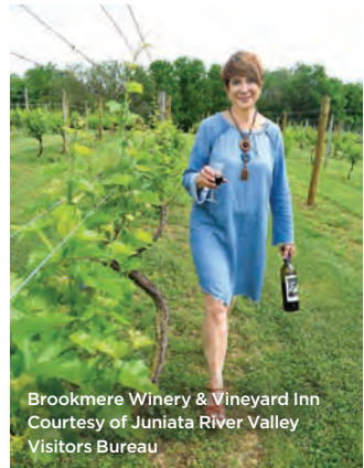
Brookmere Winery & Vineyard Inn

It's a place that often feels a world apart but is truly in the center of it all.