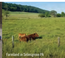
Farmland in Selinsgrove PA