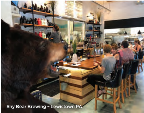
Shy Bear Brewing – Lewistown PA